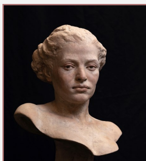
2024 First Place Sculpture

Louise Weir Sima , 18x14x9.5", ceramic with oil paint