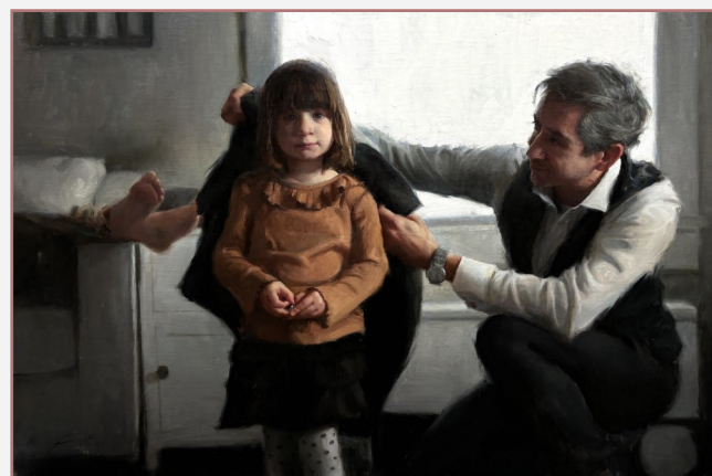
2024 First Place Painting

David Jamieson Writer's Block , 24x18", graphite, carbon black and white chalk on gray paper