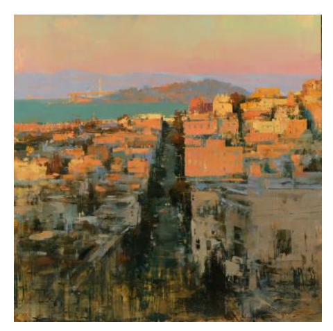
Hsin-Yao Tseng 2023 1st Place Landscape