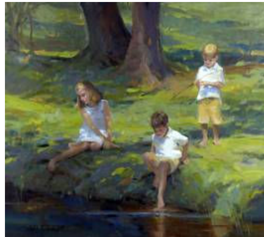
Private collection. oil